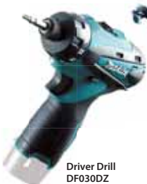
Driver Drill DF030DZ