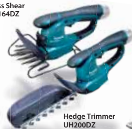
Hedge Trimmer UH200DZ