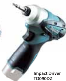
Impact Driver TD090DZ