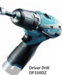
Driver Drill DF330DZ Tool does not come with bit.