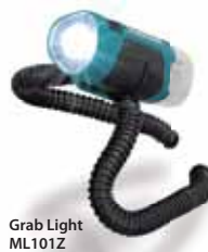
Grab Light ML101Z